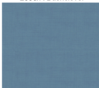
1473/B26 New Colour