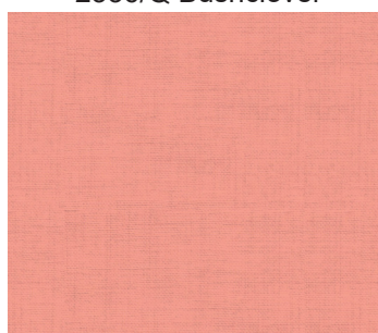
1473/P23 New Colour