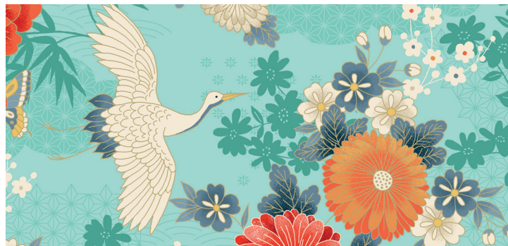
*2330/T Large Floral