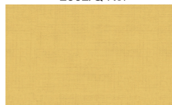
1473/Y22 New Colour