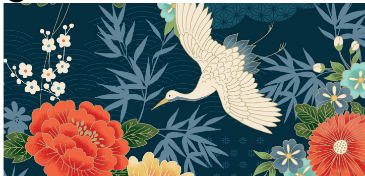
*2330/B Large Floral