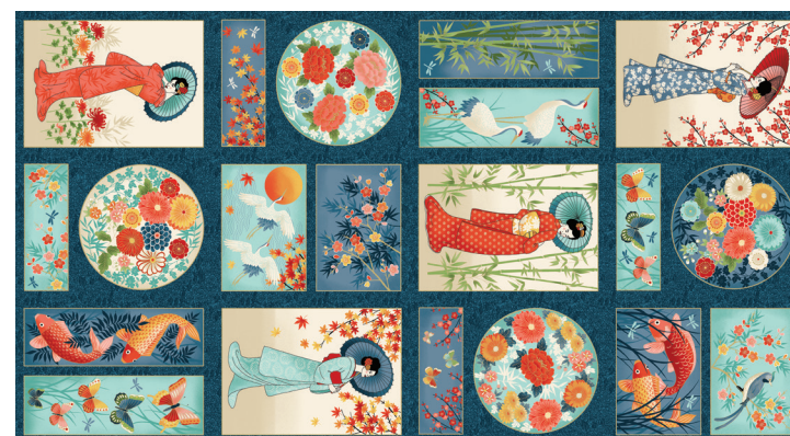
*2337/1 Panel Each panel 60 x112cms (24" x 44")